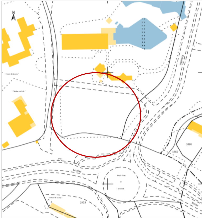
Section B 03 – Parcelle n° 3325 Sainte Maxime (83)