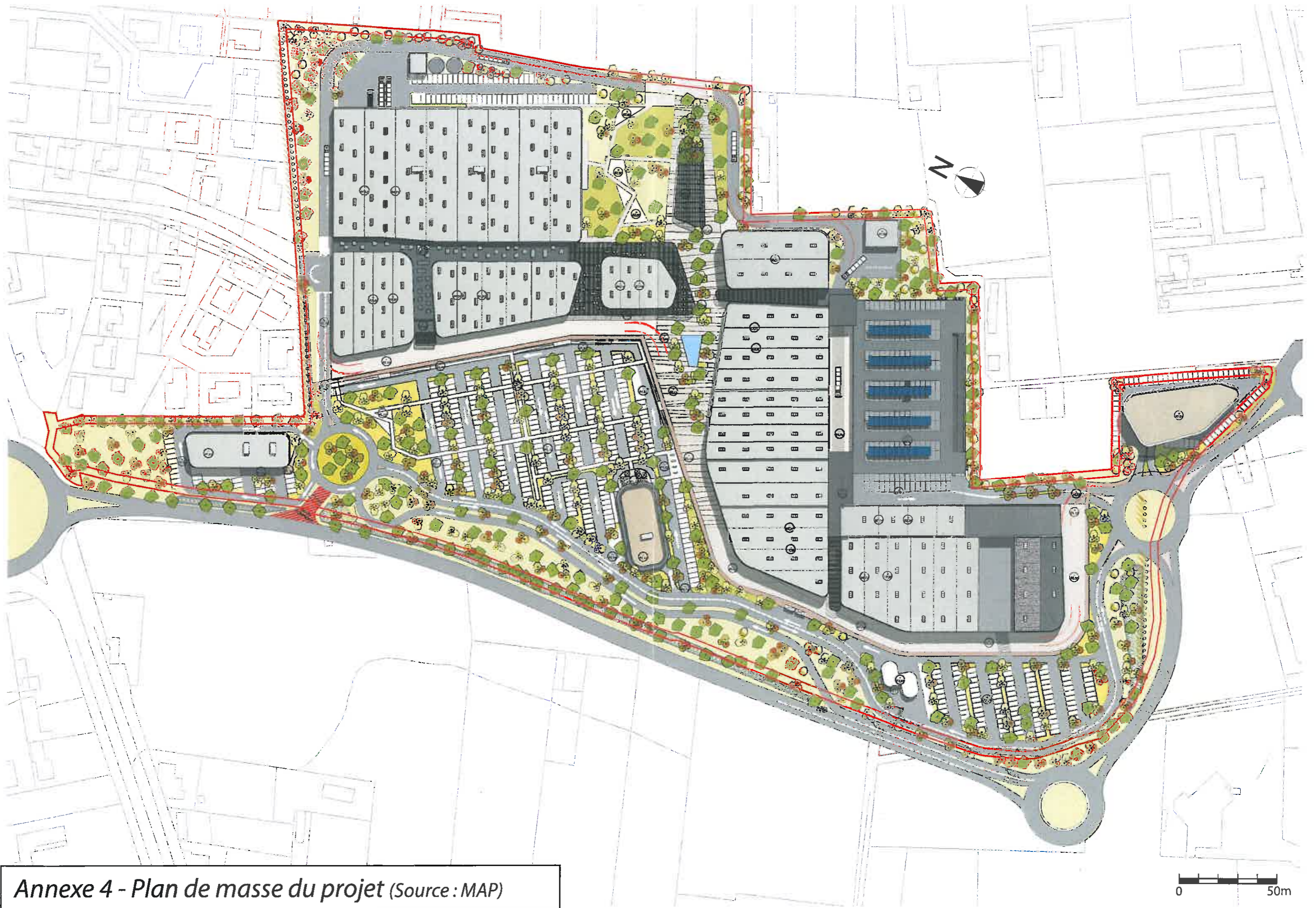
Annexe 4 - Plan de masse du projet